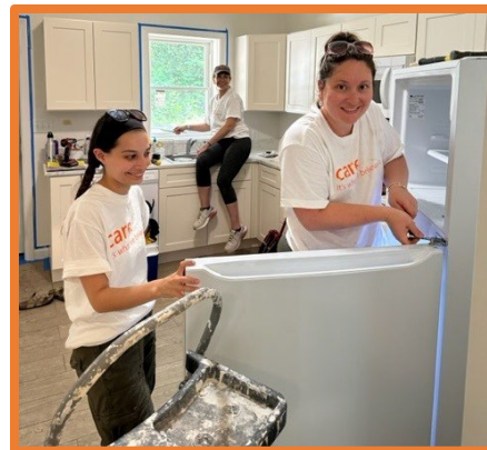
Fallon Health Care Ambassadors at a Habitat for Humanity home build.

“ My deck was rotting, so now it is safe for me to use as one of my exits. I really appreciate that it was available because I wouldn't have been able to afford to do it without this help. I bought the house in 1999 and I hope to stay here until God tells me I can't. I'm very grateful for getting the roof and the deck fixed. ”