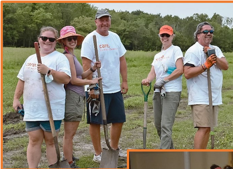
Fallon Health Care Ambassadors at the Community Harvest Project (above) and the Ron Burton Training Village (right).

In 2023, Fallon Health employees donated more than 6,426 volunteer hours at dozens of organizations. In addition to time employees spent volunteering locally, leaders at Fallon Health served on the boards and committees of many local organizations including Boston Healthcare for the Homeless, the Boys and Girls Club of Worcester, CASA Project of Worcester, Girl Scouts of Central and Western Mass., Mechanics Hall, Open Sky Community Services, Reliant Health Foundation, RFK Community Alliance, Worcester Economic Club, Worcester Regional Chamber of Commerce, and the YWCA of Central Massachusetts.